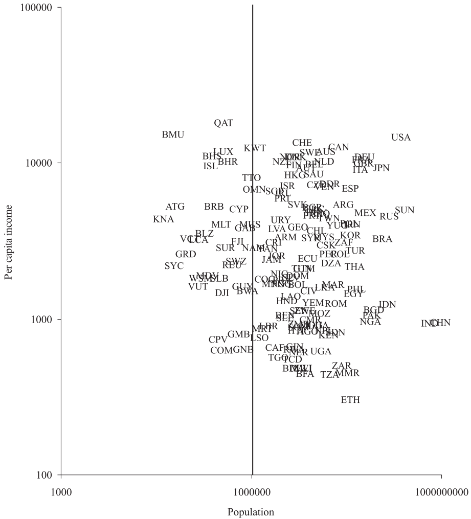
Figure 1. Per capita income and population size, averages 1960–95.